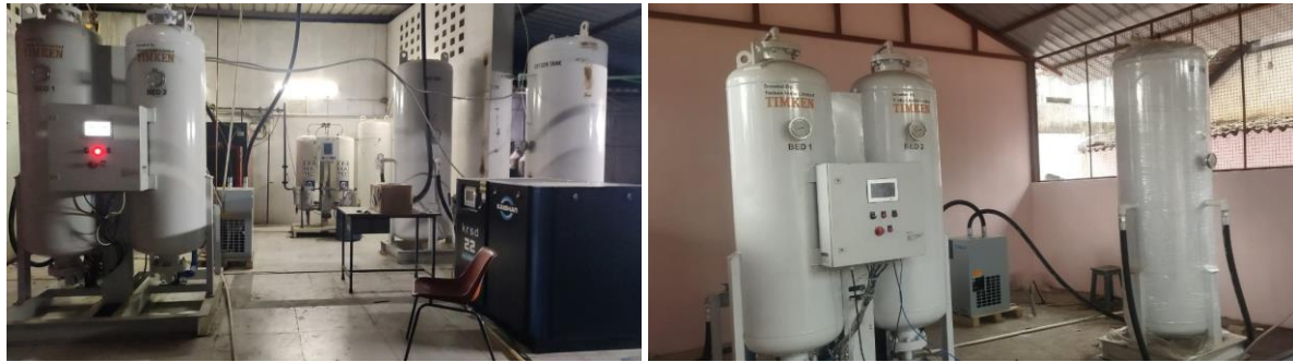
(Note: Actual project pictures)

Funds worth Rs. 3,64,84,515 were spent on this project.