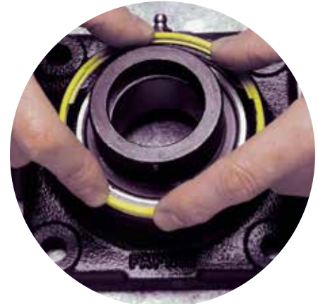
Simple mounting procedures enhance end cap value.