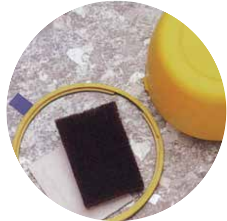
Kit contains everything needed for durable mounting.