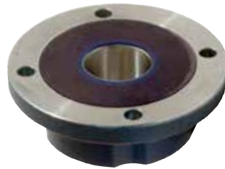
URETHANE BACKING PLATE

Provides an extra barrier for any flange block application requiring secondary sealing from the back side