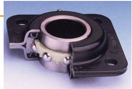
Timken® Fafnir® 491A disk harrow unit