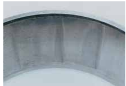
Fig. 1 - Outer race (cup) scalloping; uneven localized wear resulting from excessive end play.

pre-adjusted wheel end assembly can be serviced. Always refer to the manufacturer's service recommendations for specific service instructions.