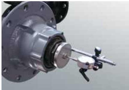
Fig. 3 – A typical end play gauge.