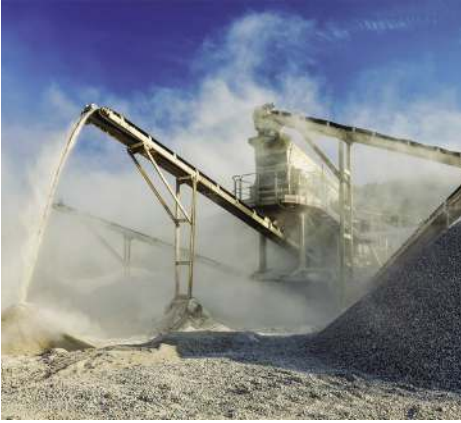
Figure 1: Jaw crusher.