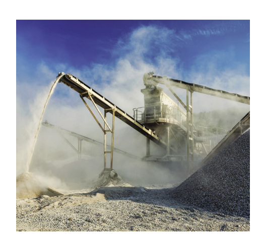
Figure 1: Jaw crusher.