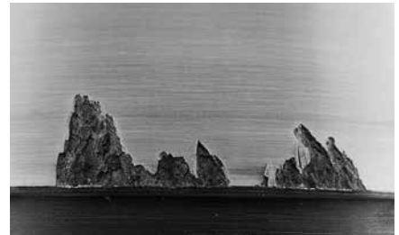
Fig. 2: Geometric Stress Concentration (GSC) spalling