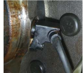
Avoid pinched cable by using retainer clips.

Cause: Sharp objects may have damaged, pinched or bent the sensor cable. Sensor cable damage is a common cause of ABS malfunctions. Installation may have damaged the wheel speed sensor.