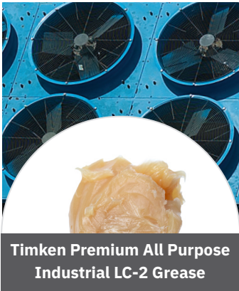
Timken Premium All Purpose Industrial LC-2 Grease

Selecting the right lubricant is critical to equipment reliability and performance. This guide helps identify Timken® grease products that can be used instead of competitor greases. By matching competitor products with equivalent Timken solutions, you can confidently transition to Timken lubricants while maintaining performance, protection, and reliability across a wide range of industrial applications.