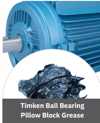
Timken Ball Bearing Pillow Block Grease