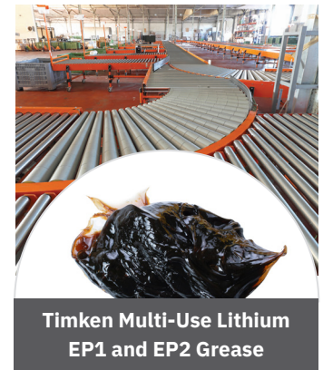
Timken Multi-Use Lithium EP1 and EP2 Grease