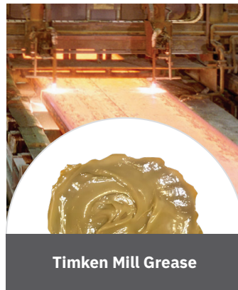
Timken Mill Grease