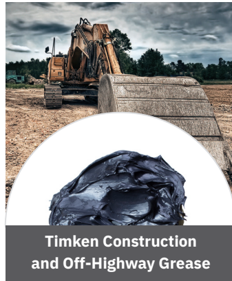
Timken Construction and Off-Highway Grease