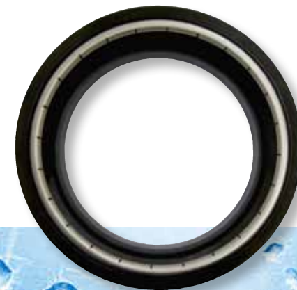
TIMKEN® SURE-FIT™ BACKING RING

Using the latest software, our engineers collaborate with customers to design MSU tubes specific to their applications. With modern foundry, machining and measuring capabilities, our MSU tubes are manufactured to provide reliable performance under the stress of heavy loads. We sell MSU tubes individually and as fully-machined and assembled packages with Timken® tapered roller bearings.