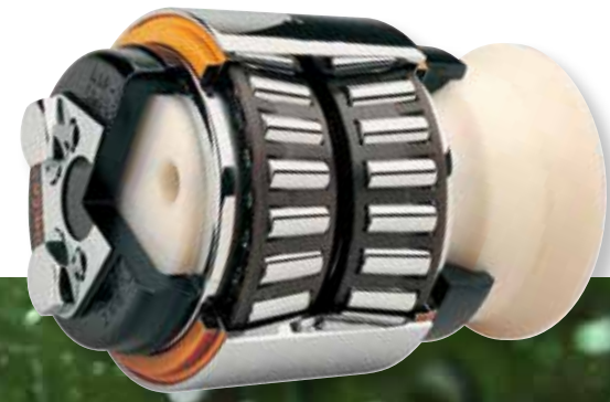
TIMKEN® AP-2™ BEARING

The Timken® AP-2™ design provides a shorter distance between the cone face and the dust guard, which reduces the amount of movement and the resultant wear on the cone back face. Also, by removing the seal wear ring, axle grooving and the resulting scrapping or expensive repairs of the axle are eliminated.