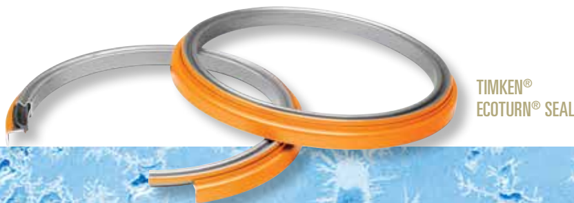
TIMKEN® ECOTURN® SEAL

Contacting or rubbing surfaces in a seal creates torque. Higher torque leads to higher bearing temperatures and requires more power and more fuel to operate. Contacting surfaces also cause components to wear down over time, reducing the ability to exclude contaminants. Reducing contact with the seal helps bearings run cooler, last longer and require less maintenance over the bearing life.