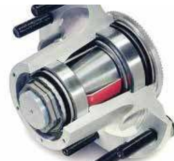
Pre-Adjusted Wheel End