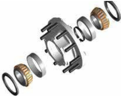
Unitized Wheel End

Get more TechTips online at www.timken.com/techtips