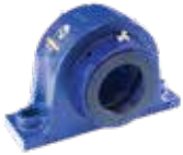
Timken® mounted solid-block spherical roller bearing with cast steel housing