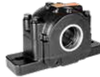
Timken® SAF/SNT mounted split-block spherical roller bearing

Timken's solutions for bulk conveyors include tough cast steel housings, heavy-duty bearing designs and multi-point sealing solutions – helping you extend bearing life in the harsh outdoor conditions of mines and quarries.