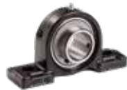
Timken® U series mounted ball bearing