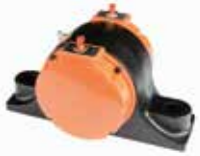
Timken® Type E mounted tapered roller bearing with multi-point sealing system