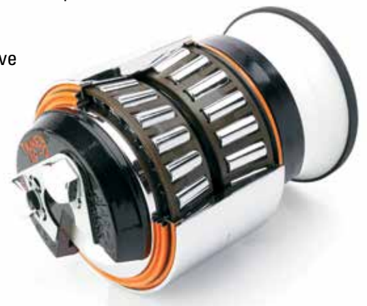
Timken AP-2™ Bearing

When integrated with innovative Timken seal designs and polymer cages, Timken's AP-2 bearing can offer significant energy efficient benefits while providing railroad operators with unparalleled performance.