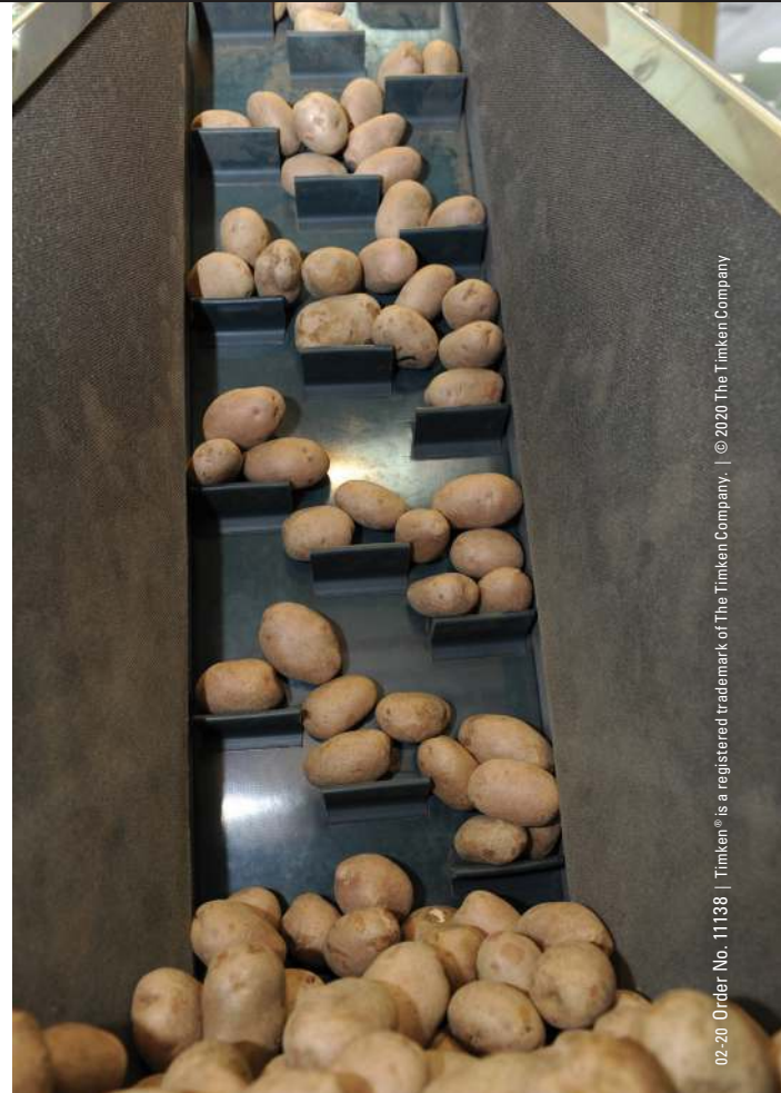
02-20 Order No. 11138 | Timken® is a registered trademark of The Timken Company. | © 2020 The Timken Company