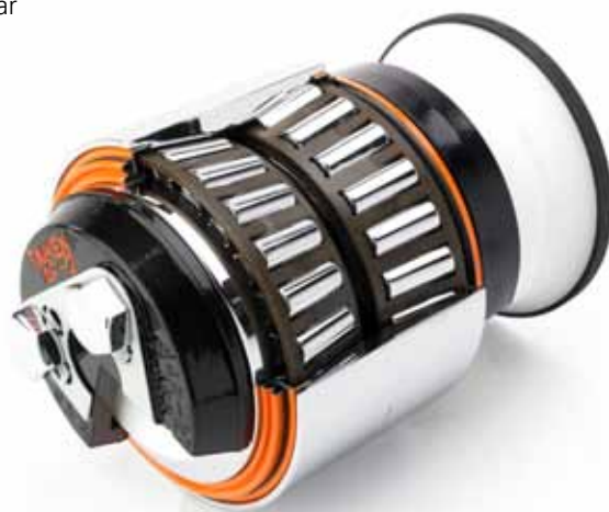
Timken AP-2™ Bearing

When integrated with innovative Timken seal designs and polymer cages, Timken's AP-2 bearing can offer significant energy efficient benefits while providing railroad operators with unparalleled performance.